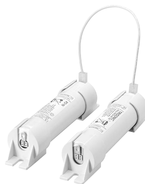
Fig. 2: Stick + Stick