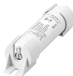
Fig. 1: Stick